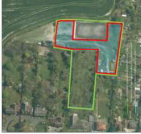
Figure 39 Diagram of the manage area and traditional for SSR 16

All surviving viable and veteran orchard trees in this area must be protected and conserved.